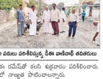
రూపాయి పనులు పరిశీలిస్తూ డీజి ఛాన్సెలర్ తదితరులు.

విదేశాపరాధ, స్వామీలు: బజ్జెట్ ప్రైవేట్ అండ్ మల్టీ సెంటర్ కంట్రాక్టర్లు అభివృద్ధి పనులు కొరకు ప్రభుత్వం వద్దకు పంపగలరు. పెద్ద పనులకు ప్రైవేట్ రంగంను ప్రోత్సహిస్తున్నట్లు తెలిపింది.