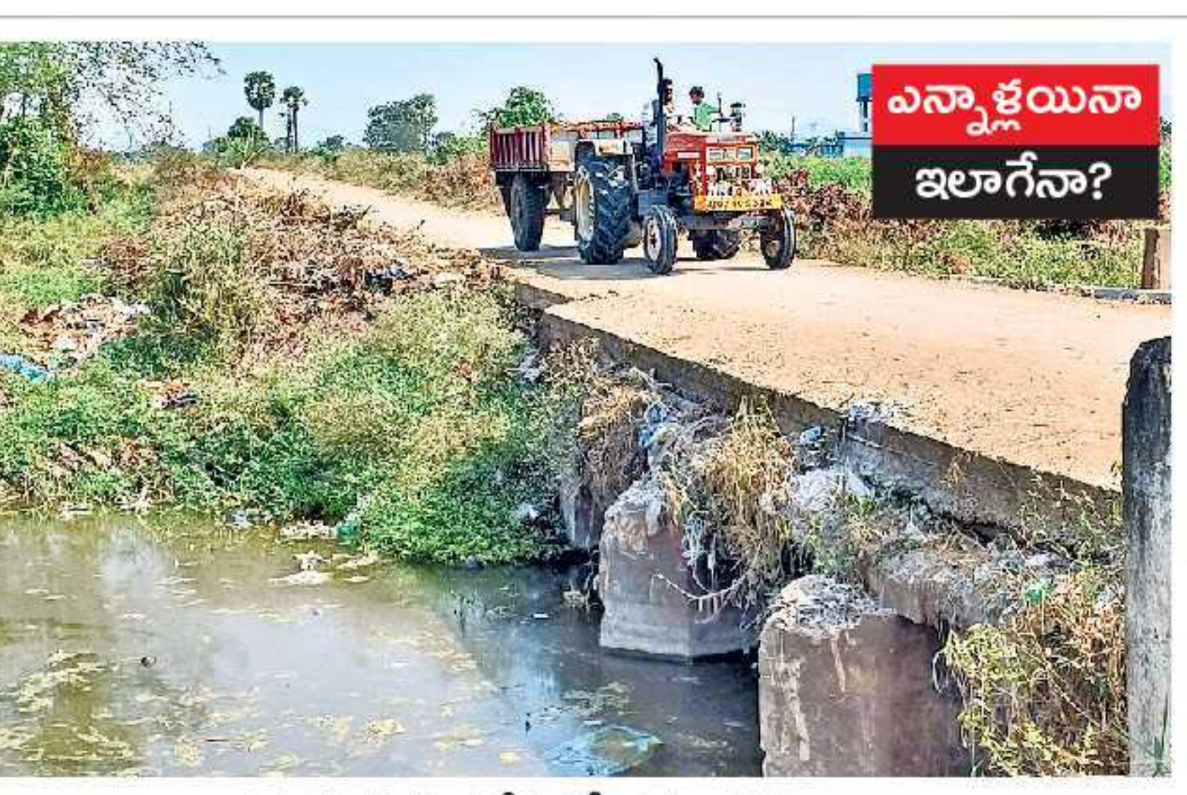
వెంకటపాలెం రోడ్డులో ప్రమాదకరంగా..

రాజధాని గ్రామమైన మంగళగిరి మండలం కృష్ణాయాపాలెం నుంచి వెంకటపాలెం వెళ్ళే మార్గంలో నాలుగు దశాబ్దాలాటి వంతెన శిధిలమైంది. రెండవైపులా రిటైనింగ్ వాల్ కూలిపోయింది. ఇదమరేన్నే నేరుగా పాలవారంలోకి జారిపోవాల్సిందే. ఈ వంతెన మీదుగానే వెంకటపాలెం సీడ్ యాక్సెస్ రోడ్డుకు రైతులు కామోక్షి సాగుస్తున్నారు. చివట గ్రామాల ప్రజలు నిత్యం మంగళగిరి చేరుకోవాలంటే ఇదే దగ్గర మార్గం. విద్యుత్తుల గ్రామాల ప్రజలు దీని మీదుగానే కృష్ణాయాపాలెం చేరుకుని మంగళగిరి వెళ్తుంటారు. - న్యూస్‌టుడే, మంగళగిరి